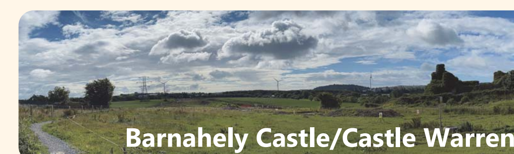
Barnahely Castle/Castle Warren