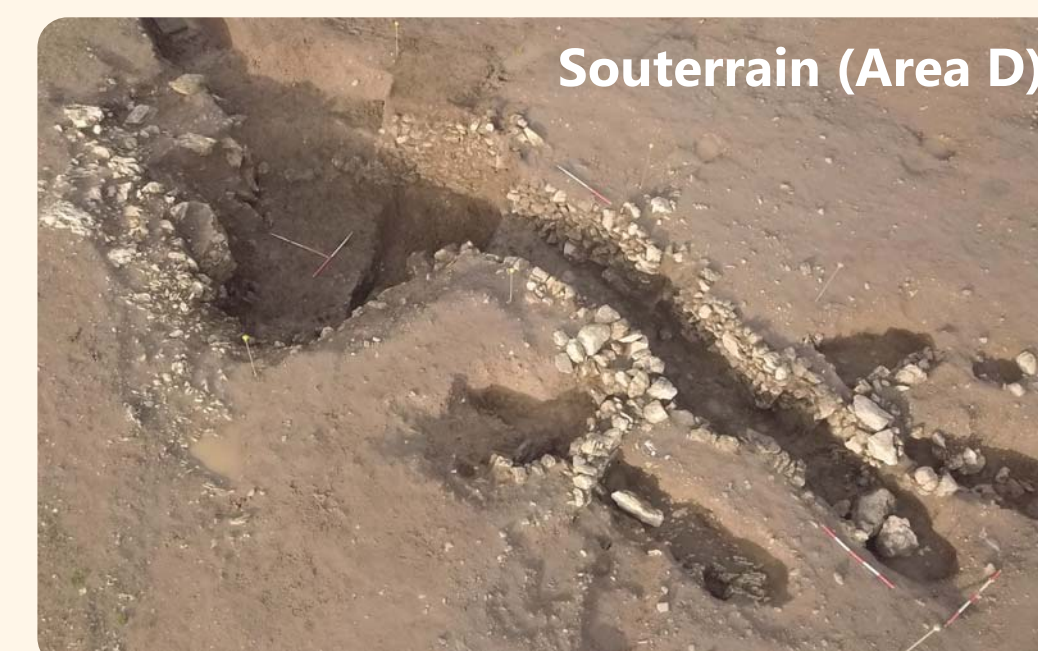
Souterrain (Area D)