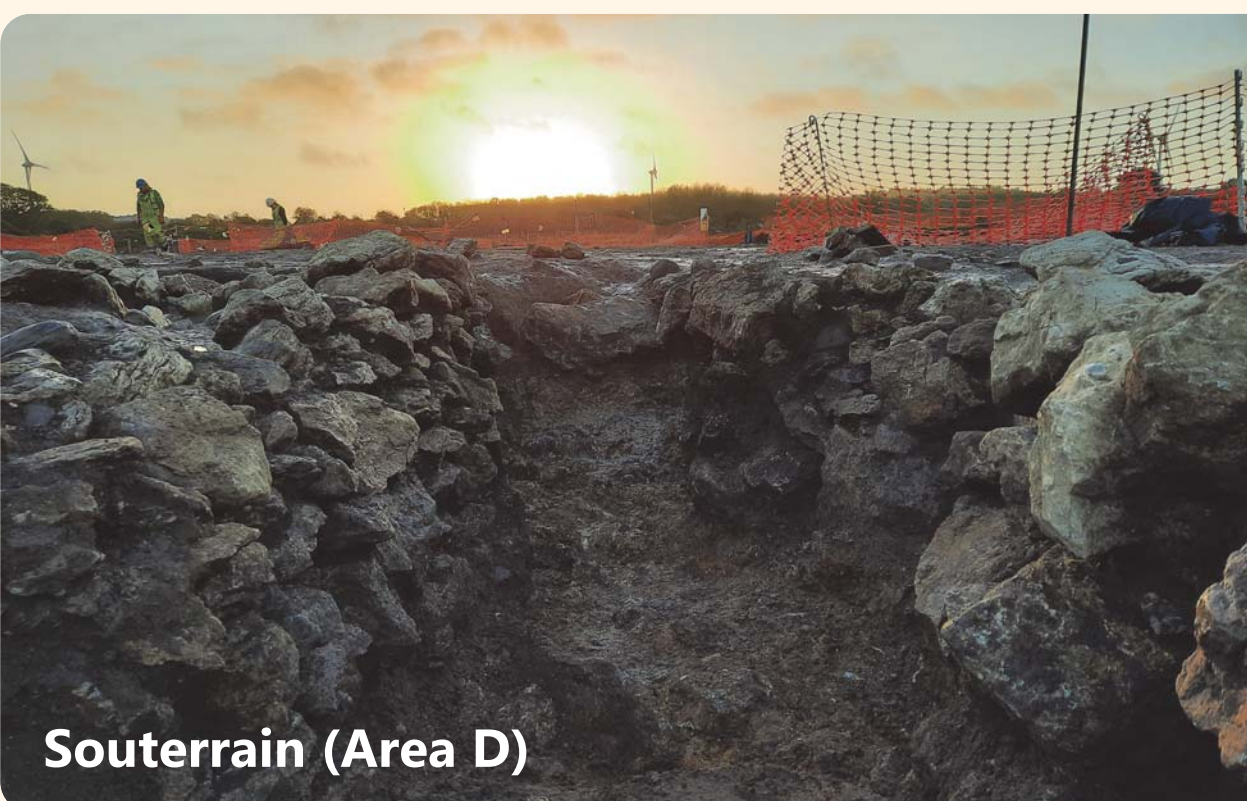
Souterrain (Area D)

Post-excavation services have yet to commence.